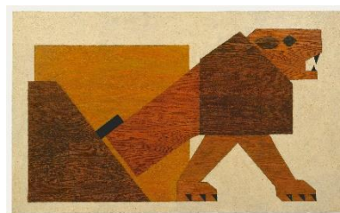
Fig.: Vilmos Huszár, Löwe, um 1928